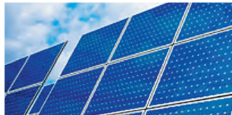
continued on page 18

Blue Sky's portfolio includes developing Clean Energy Power Stations and Microgrids, providing project consultancy and development services,